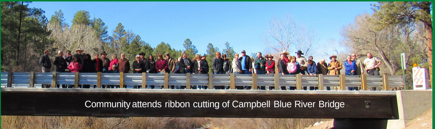
Community attends ribbon cutting of Campbell Blue River Bridge